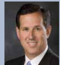
Sen. Rick Santorum Presidential Candidate