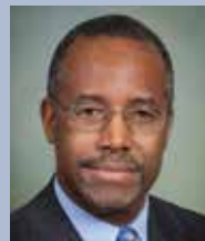
Dr. Ben Carson Presidential Candidate

With the proper tax code and regulatory environment, the proper trade environment, and energy costs at the lowest of any other country in the world for as far as the eye can see, that's a game changer. You slash corporate taxes and repatriate trillions of dollars to build factories here in America. You want to win Ohio, win Pennsylvania? That's how. ■