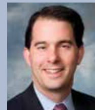
Gov. Scott Walker Presidential Candidate