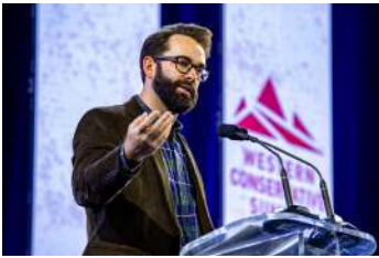
Matt Walsh of The Daily Wire