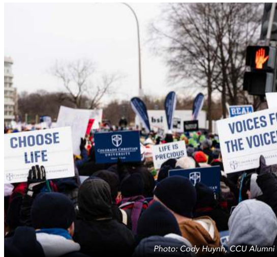
CCU students marching in the National March for Life on January 21, 2022 in Washington, D.C.