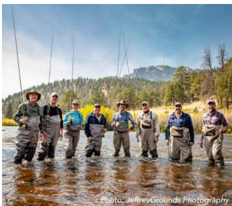
National conservative leaders gathered for a day of fishing and strategy development with the Centennial Institute.