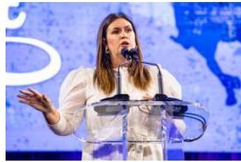
Sarah Huckabee Sanders