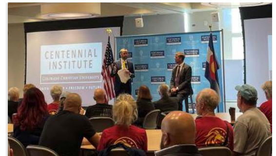
CD-7 Candidate Forum

CD-7 Candidate Forum , September 29, 2022. As part of the Centennial Institute's mission to encourage members of our community to be educated voters every November, we hosted a candidate forum for the Congressional candidates of Colorado's District 7 to offer their vision for the future of Colorado and the United States.