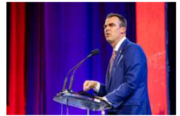
Governor Kevin Stitt