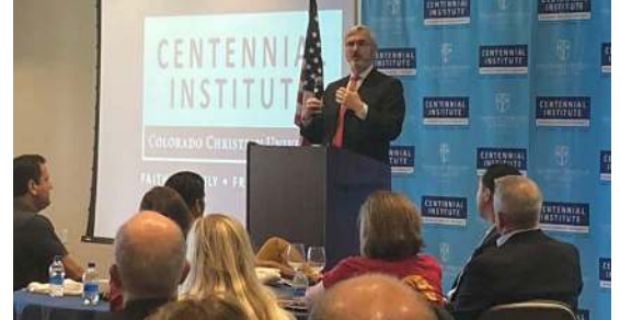
Constitution Day Breakfast with John Malcolm

Constitution Day Breakfast , September 16, 2022. John Malcolm, Vice President of The Heritage Foundation's Institute for Constitutional Government, delivered a keynote address about the importance of preserving the U.S. Constitution for the next generation during our first annual Constitution Day celebration.