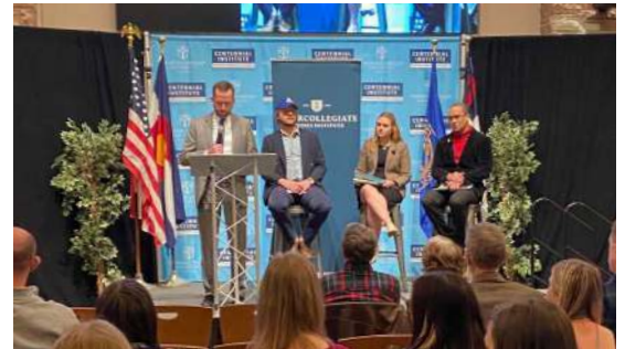
Are Reparations Key to Achieving Racial Reconciliation?