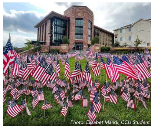
9/11 Flag Memorial on Colorado Christian University's campus. We are one of the few campuses that continues to remember.