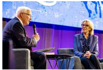
The Hon. Betsy DeVos