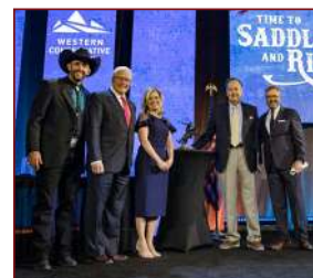
CAL THOMAS Syndicated Columnist 2022 William L. Armstrong Award Winner