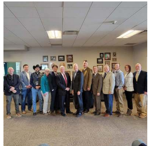
U.S. Senator Rick Scott (FL) visited the CCU campus and engaged with students, faculty, and university leadership.